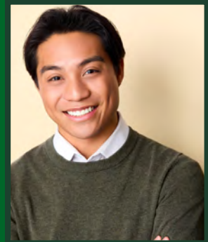
Eco Jam Performer