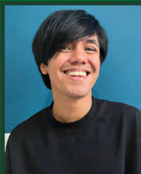
Eco Mau Performer