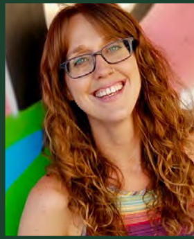
Eco Mo Sponsor Liaison