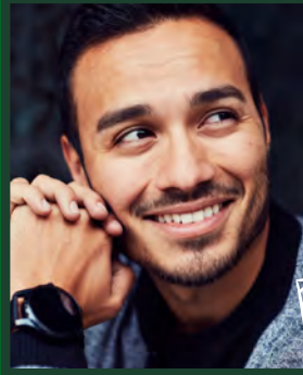
Eco TKO Performer