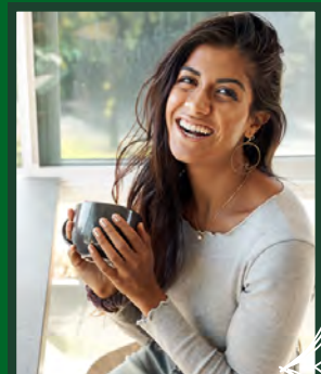
Eco Amby Performer