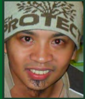
Eco Rays Logistics