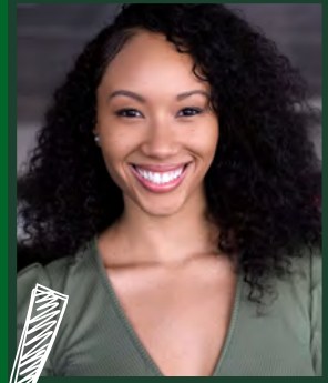
Eco Shara Performer