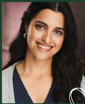
Eco Vizzy Performer