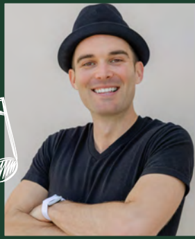
Mr. Eco CEO & Performer