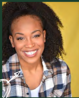
Eco Sistah Performer