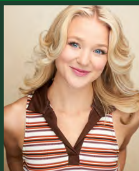
Eco Fel Performer