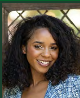
Eco Eden Performer