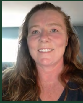
Eco Ruth School Booker