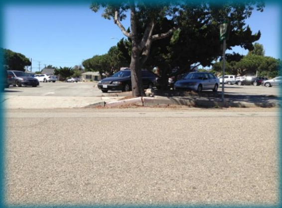
Mid-Town Parking Lot