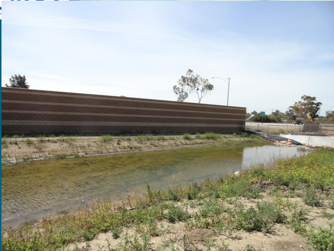
Construction phase of detention basin