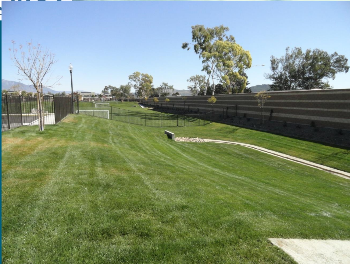
Park and Detention basin